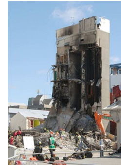
Fig.1 Remain of the CTV building after the collapse

A six-story high, reinforced concrete (RC) framed structure called the Canterbury Television (CTV) building collapsed totally with only the north-core wall remained standing (Fig.1), due to the earthquake of magnitude 6.3 which occurred in New Zealand on 22nd of February, 2011. Many overseas students including Japanese students died in the event. Hyland and Smith [1] investigated on the possible cause of the collapse. They concluded that the building swayed and twisted violently. Once the column on the mid to upper levels on the east face failed, other columns rapidly became overloaded and failed. Then the beams and floor slabs fell down and broke away from the north-core.